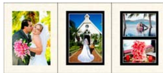
FP 1P 2L

Your choice of any combination of the 3 image templates above.