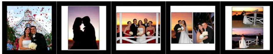
FP 1P 1L 2P 2L

Your choice of any combination of the 5 image templates above.